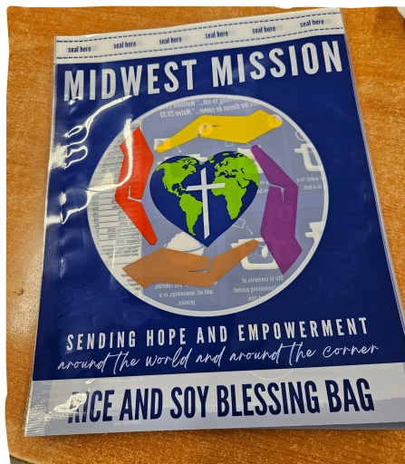
Packing meals for Jamacia!